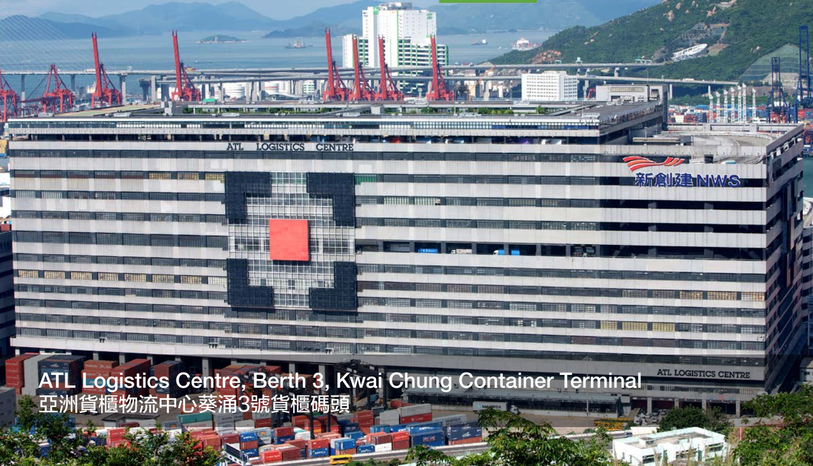
ATL Logistics Centre, Berth 3, Kwai Chung Container Terminal 亞洲貨櫃物流中心葵涌3號貨櫃碼頭