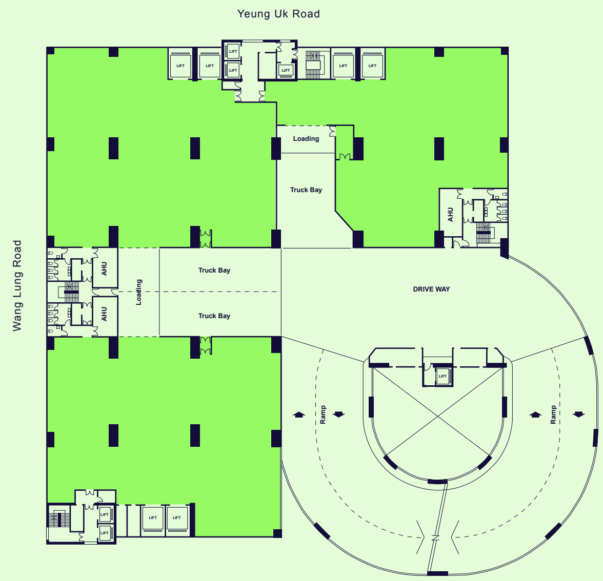
Floors 1-12 (ramp-access) 1-12樓層 (可經車道直達)